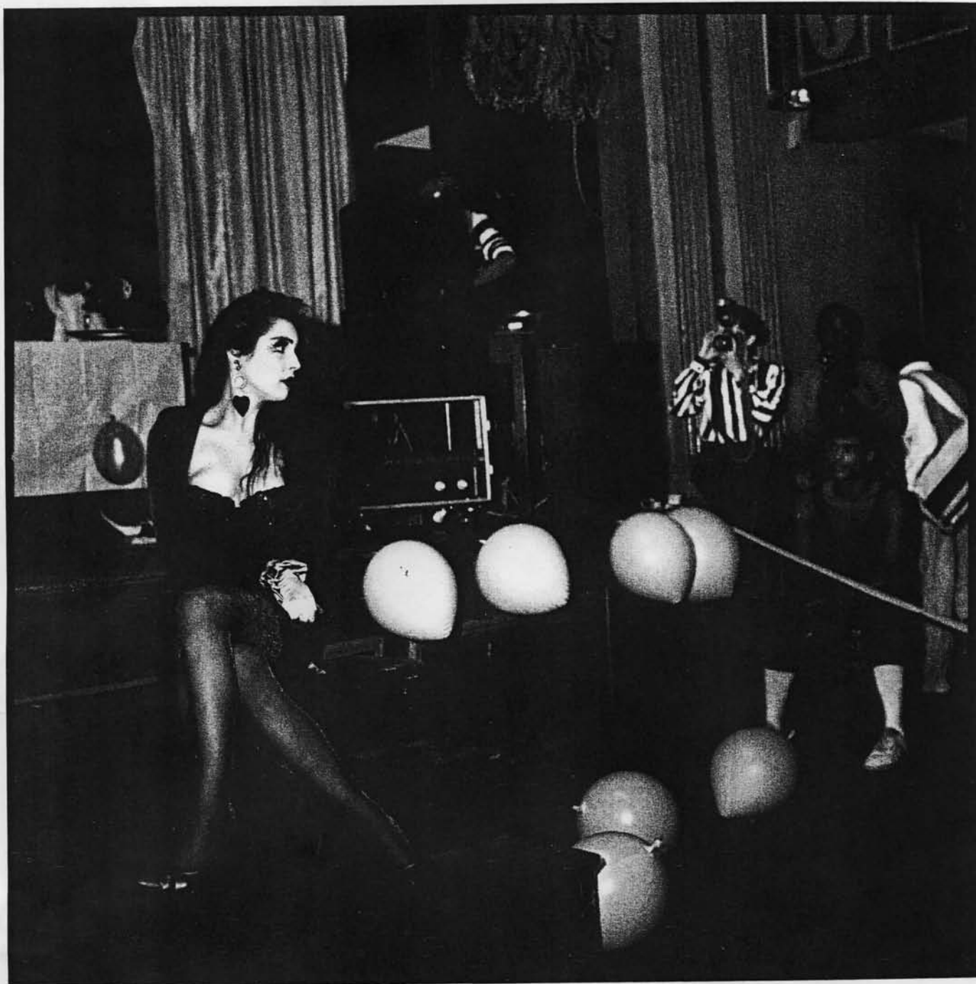
Sylvia Plachy, Princess Myra, Field Ball At The World, May 1988

queens” (masculine gays), or “femme queens” (men who dress like women). Women are either “butches” (masculine lesbians) or “best-dressed women” (feminine women, either gay or straight). Yet even at the drag ball, the gender definition is strict. It’s assumed that a “butch,” or very masculine woman, would never be heterosexual. Furthermore ball-goers also assume that, whether you date people of your own sex or of the opposite sex, you will always couple with someone of—more or less—the opposite gender. Participants adhere to commonly accepted codes of masculinity and femininity, as if even the